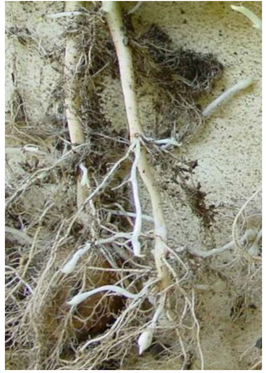
Figure 2. Tuber initiation (TI) is defined as stolon ends swelling to twice the width of the stolon